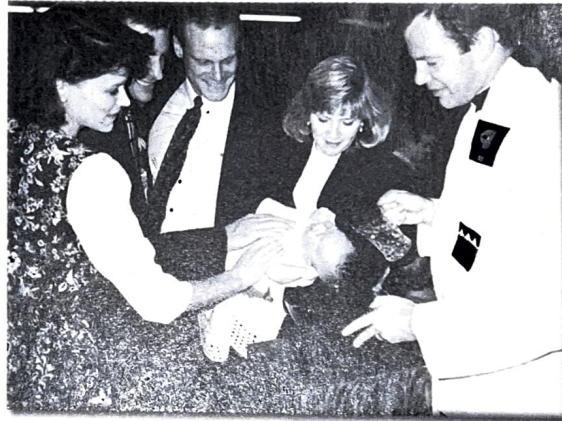
Pouring water to baptize

The priest, or deacon, uses water to baptize us. Through Baptism we are joined to Christ. We receive new life in Christ and are born into the Church family. Our sins are forgiven, and we receive the gift of the Holy Spirit.