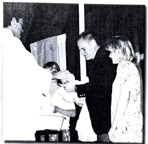
Anointing with chrism